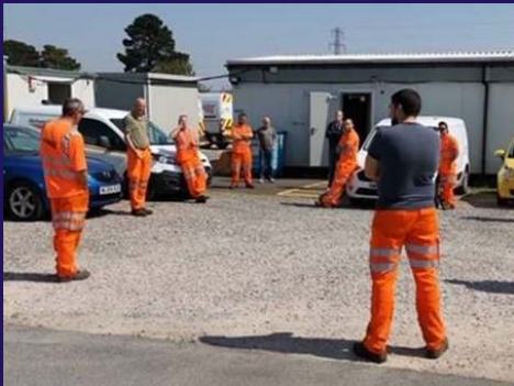
Social distancing during meetings outdoors

Objective: To reduce or eliminate transmission due to face-to-face meetings and maintain social distancing in meetings.