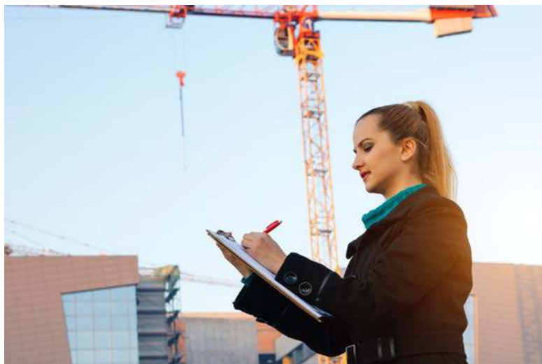
Visitor signing in