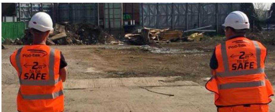
Uniform signage for workers to provide clear messaging